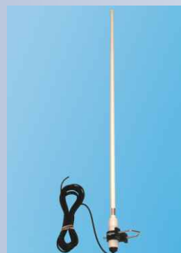
HG1 Omnidirectional HG2 Directional

HG2 is a directional antenna with even higher gain. Please contact us for more details.