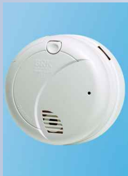
4660-GB Grade 2

Optical sensor gives greater stability compared to ionization types.