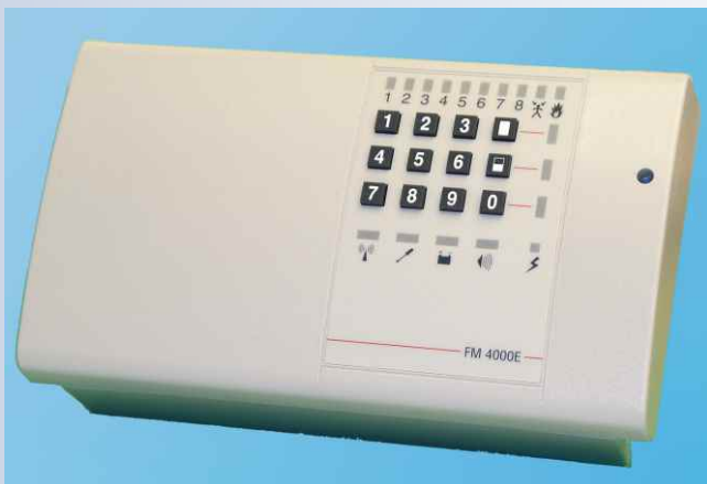
FM4000E Cost effective 8 zone panel Designed to meet BS6799 Class3

For applications where security grading is not required.