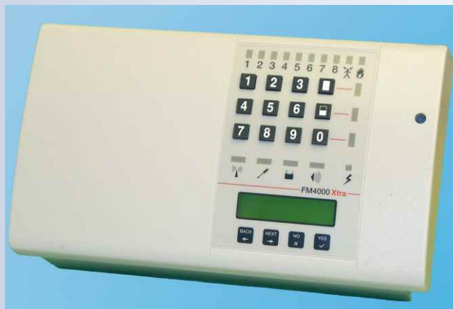
FM4000Xtra Grade 2 and BSDD243:2004

Includes connections for SAB, FM wireless Siren, autodialler and 8 input digi (or other communication module).