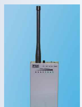
4030-GB All Grades

Operates in conjunction with either test transmitter.