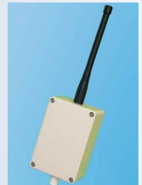
4156-GB Grade 1