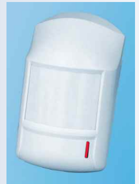
4605-GB Grade 2

For use with any FM4000 series control panel or interface