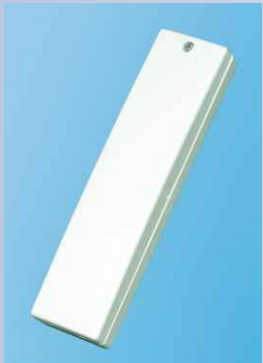
4650-GB Grade 2

Industrial alarm applications include Temperature, Pressure, Water level and emergency alarms requiring immediate response.