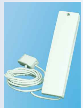
4655-GB Grade 2

Integral reed contact plus screw terminals for open or closed alarm contacts.