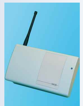
4158-GB Grade 2

Mains powered with provision for a 2.1Ah back up battery.