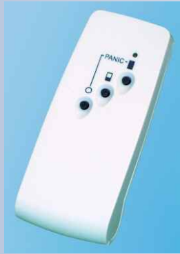
4173-GB Grade 2

A remote control for all FM4000 control panels. Enables alarm control units to be partly and fully armed and disarmed from a distance of up to 100 metres and incorporates a dual action panic alarm for additional protection.