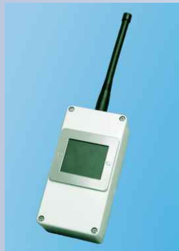
4193-GB Grade 1