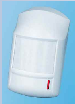
4600-GB Grade 2

For use with any FM4000 series control panel or receiver interface.