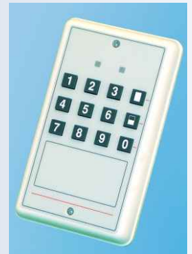
4180-GB Grade 2

This wirefree keypad controls all FM4000 series alarm control panels, up to 100 metres from the alarm control unit. The keypad includes a programmable panic and duress facility for added user safety.