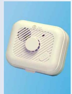
4665-GB Grade 2

Heat detectors are less prone to false activation in dusty environments.