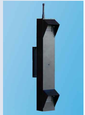
4195-GB Grade 1